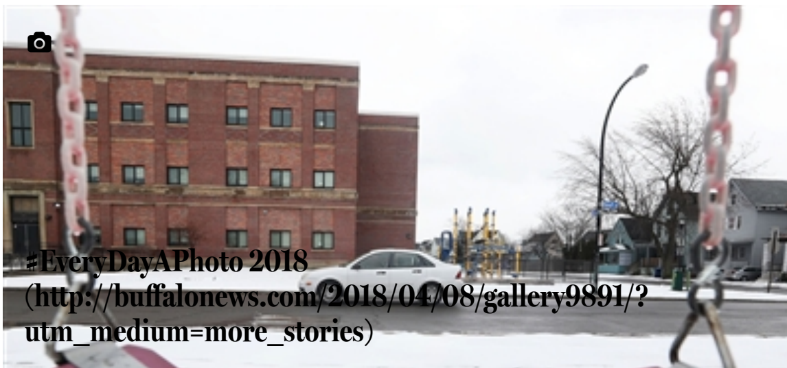
#EveryDayAPhoto 2018 ( http://buffalonews.com/2018/04/08/gallery9891/?utm_medium=more_stories )