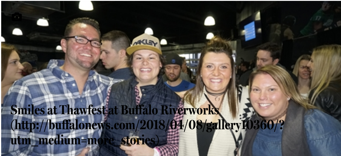
Smiles at Thawfest at Buffalo Riverworks ( http://buffalonews.com/2018/04/08/gallery10360/?utm_medium=more_stories )