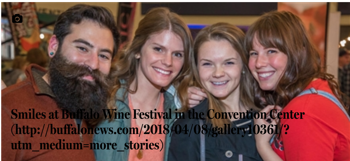
Smiles at Buffalo Wine Festival in the Convention Center ( http://buffalonews.com/2018/04/08/gallery10361/?utm_medium=more_stories )